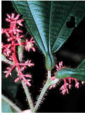
27 Tococa caquetana MELASTOMATACEAE