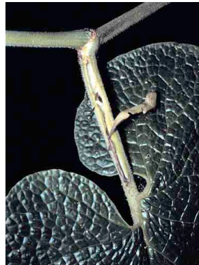
33 Piper [Costa Rica] PIPERACEAE