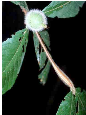
39 Duroia hirsuta RUBIACEAE