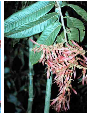
35 Triplaris poeppigiana POLYGONACEAE