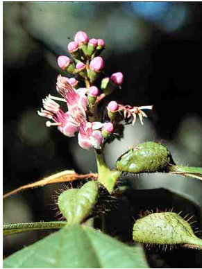
28 Tococa guianensis MELASTOMATACEAE