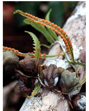
40 Solanopteris bifrons PTERIDOPHYTA