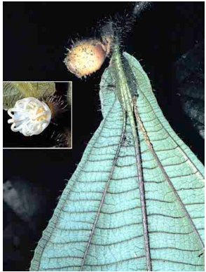
26 Maieta guianensis MELASTOMATACEAE