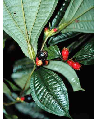
25 Maieta guianensis MELASTOMATACEAE