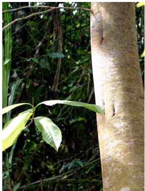
36 Triplaris cumingiana POLYGONACEAE