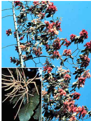
34 Triplaris americana POLYGONACEAE