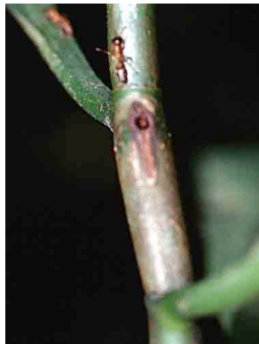
37 Triplaris weigeltiana POLYGONACEAE