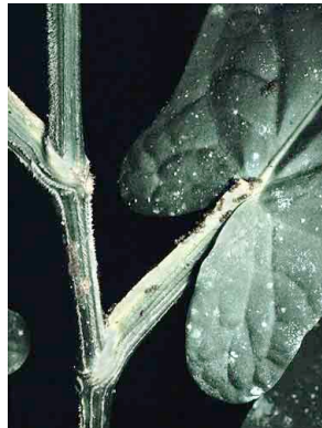
32 Piper sagittifolium PIPERACEAE