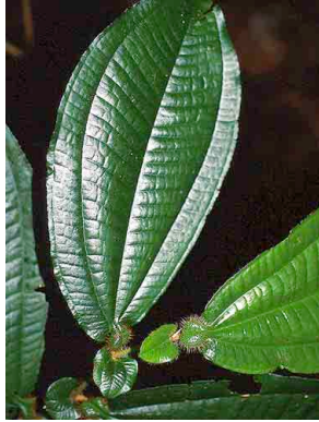
22 Clidemia heterophylla MELASTOMATACEAE