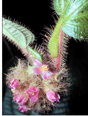
24 Clidemia taurina MELASTOMATACEAE