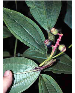
30 Tococa stenoptera MELASTOMATACEAE