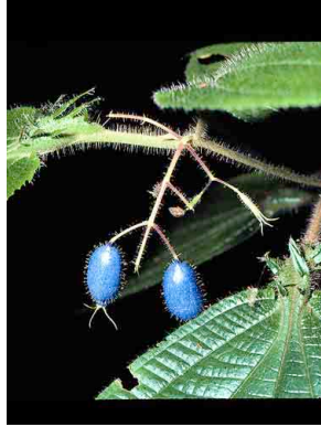
23 Clidemia foliosa MELASTOMATACEAE