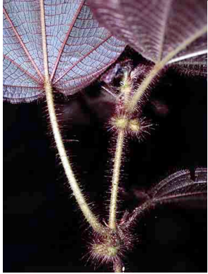
21 Clidemia allardii MELASTOMATACEAE

[www.fmnh.org/plantguides][RRC@fmnh.org] Rapid Color Guide # 29 version 1.4