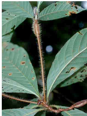
38 Duroia hirsuta RUBIACEAE