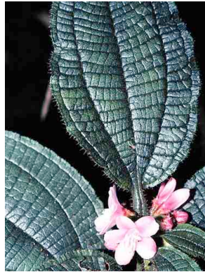
29 Tococa stephanotricha MELASTOMATACEAE